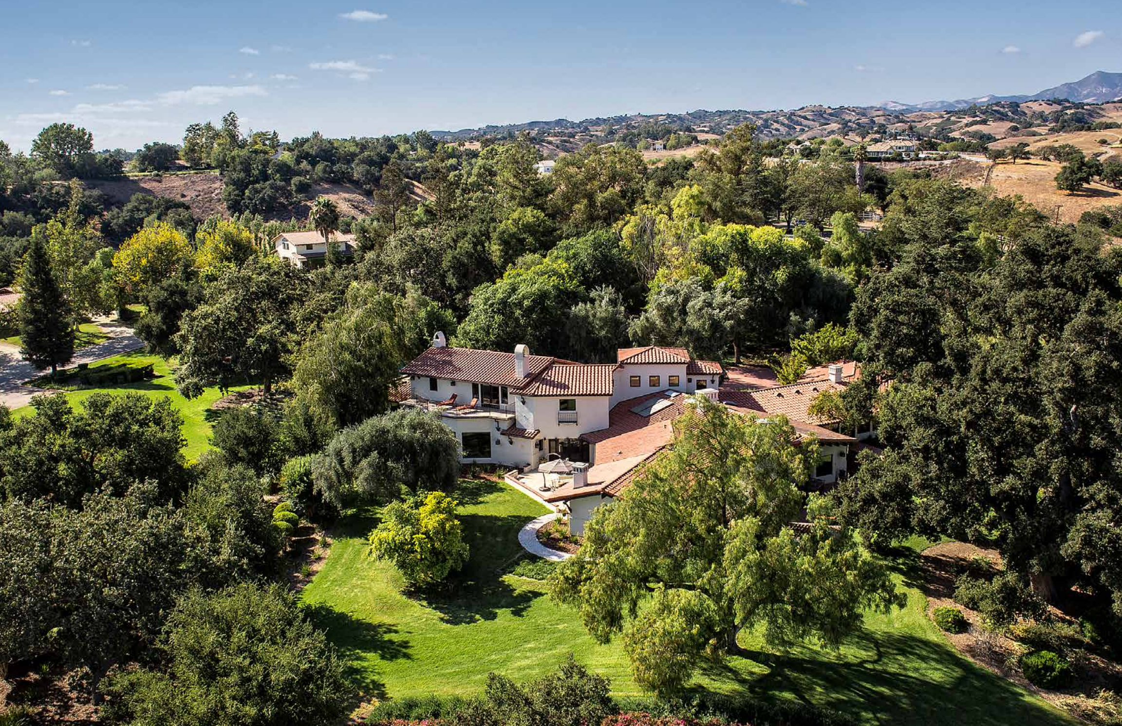
HACIENDA LA CUMBRE, SANTA YNEZ VALLEY, SANTA BARBARA COUNTY, CALIFORNIA